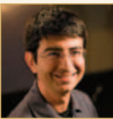
Pierre Omidyar, founder of eBay