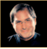
Steve Jobs, founder of Apple Inc