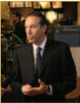
Howard Schultz, founder of Starbucks