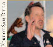
Larry Ellison, founder of Oracle Corporation