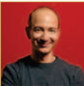
Jeff Bezos, founder of Amazon.com