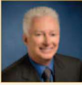
A G Lafley, former chairman, president and CEO of Procter & Gamble