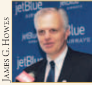
David Neeleman, founder of JetBlue Airways