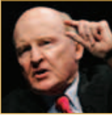
Jack Welch, former chairman and CEO of General Electric