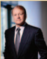
John Chambers, chairman and CEO of Cisco Systems, Inc