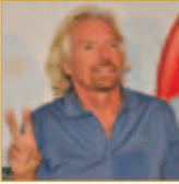
Richard Branson, founder of Virgin Group