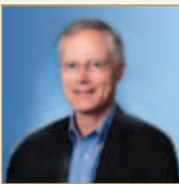
Scott Cook, founder of Intuit